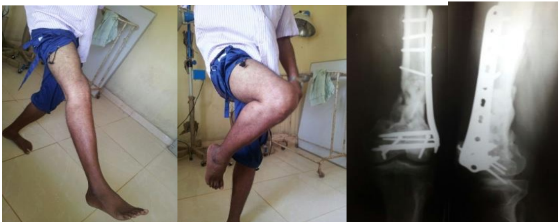
20 Weeks Follow Up