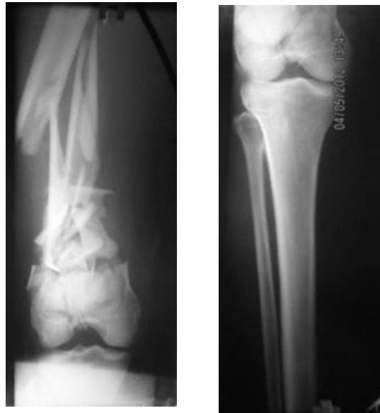
Pre operative x-Ray

Rigid Fixation of comminuted distal femoral fractures in young person's or in osteoporotic Bone with locking compression plate maintains reduction by anchorage on the fractured fragments and which when applied with meticulous soft tissue handling permits vigorous early knee mobilisation. This results in functional rehabilitation of the patient to an ultimate union. This procedure ensures congruency and length avoids malunion knee stiffness shortening, non-unions using the same implant. To conclude the locking compression plate for distal femur fracture is a safe and effective tool to manage these difficult fractures.