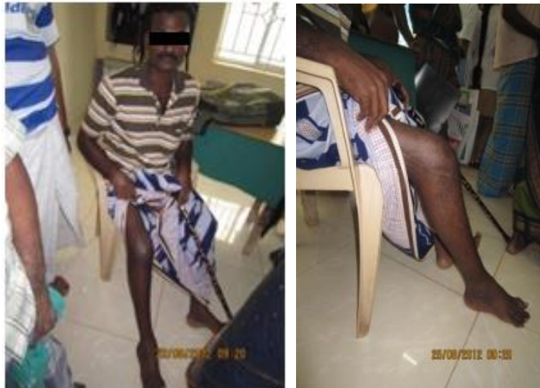
Immediate Postoperative Clinical photo